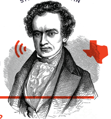
STEPHEN F. AUSTIN

Decades as Government & Conventional Banking Regulations do not allow traditional mortgage financing for distressed property acquisition & renovation when intended for Real Estate Investment purposes, e.g House Flippers and BRRRR strategy investors. Because of this, there has been a void created in available financing for Real Estate Investors which has allowed Private Lenders the opportunity to fulfill that void and reap the benefits.