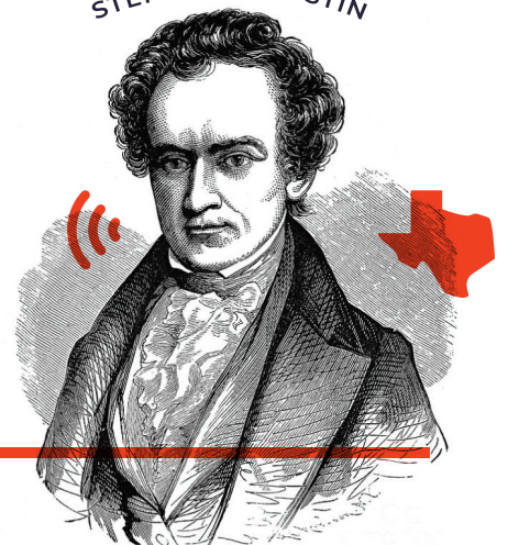
STEPHEN F. AUSTIN

I'm glad you asked, check out the other side of this page and find out. ➔